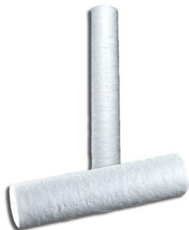
Figure 1: Hytrex Depth Cartridge Filters