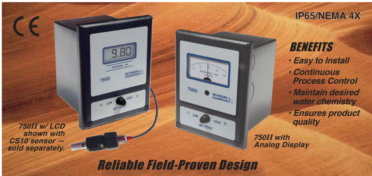
750II w/ LCD shown with CS10 sensor — sold separately.