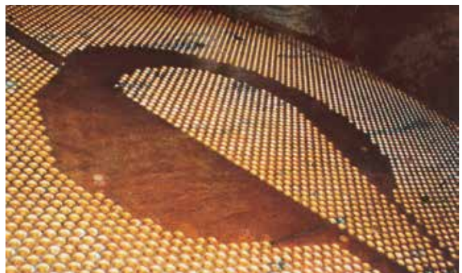
AFTER — CHLOROPAC® SYSTEM CLEAN CONDENSER TUBE PLATE